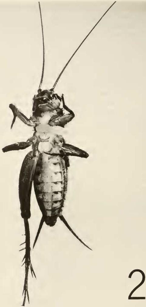
Fig. 2. Egg of Lyroda subita attached to gryllid prey at right forecoxal corium and extending laterally between fore- and midlegs. Note missing left hindleg.

some of the L. subita nests we excavated contained only Allonemobius fasciatus or A. carolinus suggests either conditioning on the part of the female wasp during hunting or that individual wasps hunted in areas where each of these species was prevalent. Similar conclusions have been drawn regarding the hunting behavior of Chlorion aerarium Patton (Peckham and